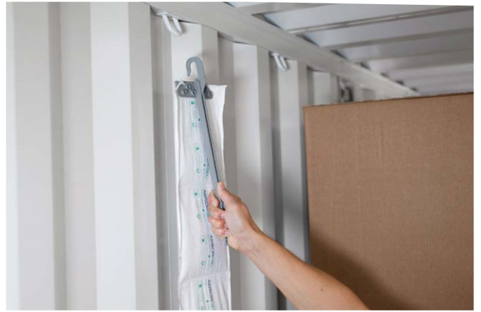
INSTALLATION USING ABSORSTICK™