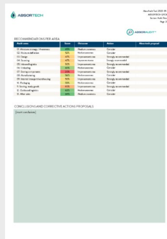
Figure 2: Extract from AbsorAudit report.